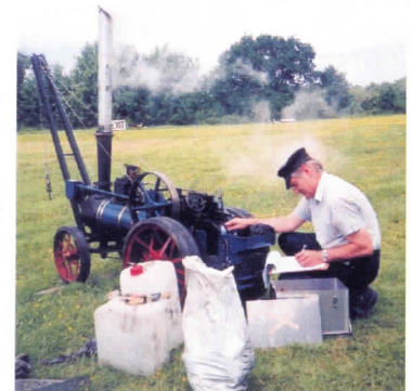
Checking Certificate of Engine.

All visiting Steam Engines, whether they are on Rail or Road, have their Boiler Certificates checked before running at The Manor Railway.