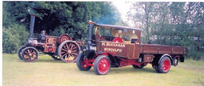
A Foden Steam Lorry and a Burrell Steam Tractor come to visit.

As a little extra for the Parents Association Picnic, the children were delighted when we had a surprise visit from a Steam Lorry and a Steam Tractor who had been passing near by.