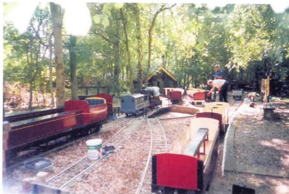
The day before Fete at Bramble Hill.