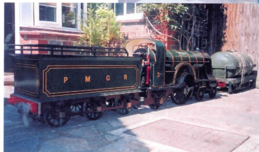
The Stirling Single in August 2003.

Hot weather has had its draw backs, with the track having to be cooled, owing to buckling under the heat.