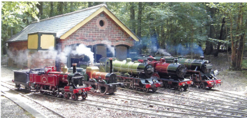
Line up of some of the Locomotives ready for Fete Day.

Many thanks once again to all those who helped me on Fete Day and made it all so successful.