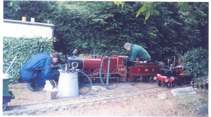
Testing the Midland Compound at Haven Road.