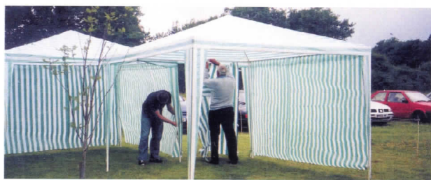
The Gazebos go up on another hot day.

Also the Gazebo Team are always there for shade in the hot weather or shelter in the rain.