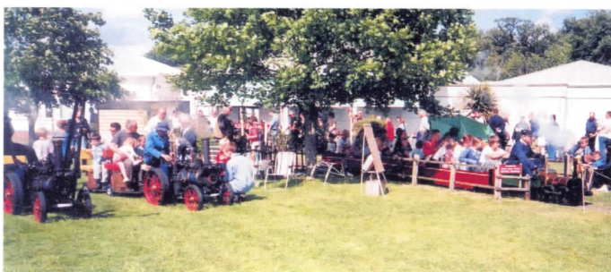
Road and Rail Rides.

O n Saturday the 21st of June, Brighton Road Baptist Church had their annual Sunday School Day, 'Picnic Outing' with lots of fun and games.