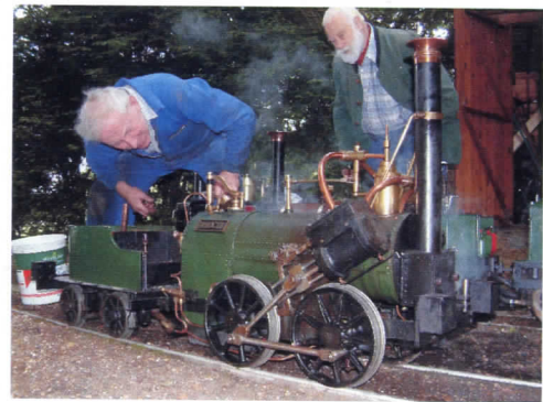
Invicta returns for Boiler Inspection.

All visiting Steam Engines, whether they are on Rail or Road, have their Boiler Certificates checked before running at The Manor Railway.