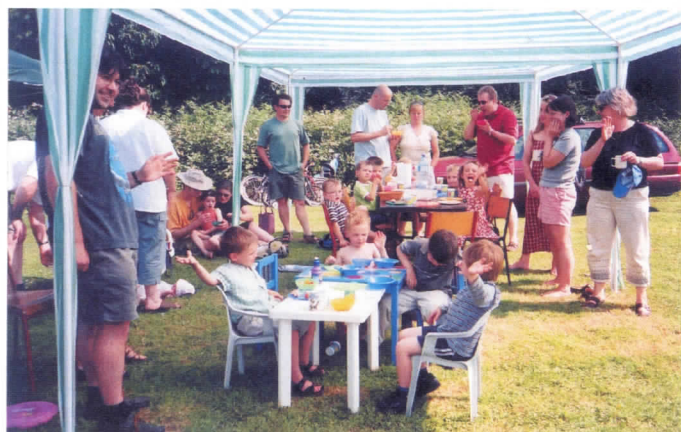
The young and old always enjoy good food and a Party.

A lso on Sunday the 15th of June, 'Happy Birthday Party' time for one of the younger visitors to The Manor Railway.