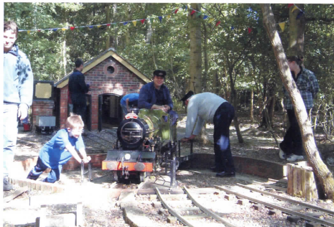
The younger generation at Bramble Hill.

W e always like to encourage young people at The Manor Railway. There are so many things to do, from learning how to maintain and run a railway, to the care and attention needed with the Locomotives. We hope that we can help encourage this new generation into the hobby of miniature railways as we were encouraged in our own youth.