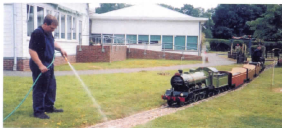
Chris Knibbs cooling the track.

Hot weather has had its draw backs, with the track having to be cooled, owing to buckling under the heat.