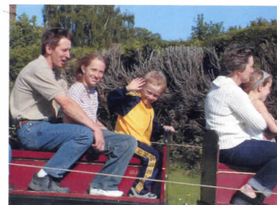
Fun for all.

S unday the 29th of June, a special day for The Children of Ingfield, when they had their annual Parents Association Picnic. At the end of the day we were so pleased when some of the children, parents and teachers joined us at Haven Road and shared a barbeque with us.