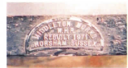
Restoration plate from the wagon below.

Stop Press!!! Fete Day's Date has changed to Sunday 8th June 2003