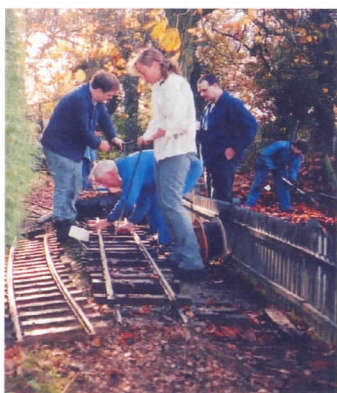
Resleeping the track panels at Haven Road.

A s there was so much support on the day we were able to undertake another project as well, which was to reballast and resleeper six lengths of track between Haven Road and Garden Crossing. This was of great help as these sections of track were deteriorating quickly.