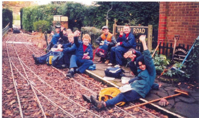
Some members of the Bluebell's 9F Club take a well earned lunch break after clearing many of the leaves on the railway.

W hilst all this reballasting was taking place we took the opportunity to lay membrane underneath the new ballast to help keep the track free of mud, weeds and dirt.