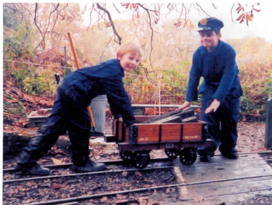
Two workers from the Bluebell 9F Club ready, willing and able, helping to resleeper the track panels at Haven Road.

W hilst all this reballasting was taking place we took the opportunity to lay membrane underneath the new ballast to help keep the track free of mud, weeds and dirt.