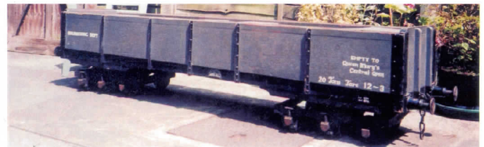
Six Wheeled Bogie Wagon Keith restored in 1971.

I am also looking forward to having my Midland Compound back at The Manor Railway. It has now been fully restored and will hopefully be making an appearance very soon.