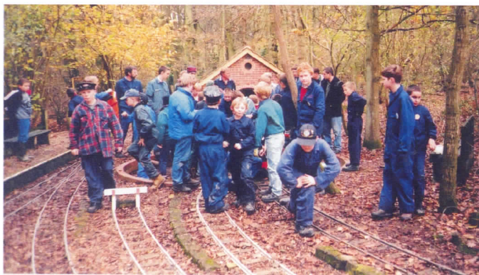
The 9F Club getting ready for a group photograph at Bramble Hill... "Come on everyone gather around!!"

A tremendous job was done by all on the day so we thought we should take a group photograph as a record of the occasion. The club shall be returning for a fun day this summer for us to say a BIG thank you to all for the hard work.