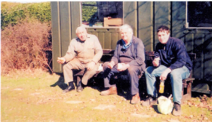
Enjoying a bite to eat in the Winter sunshine outside The Cabin.

A bit of sunshine and heat certainly does make a lot of difference and it's so lovely to be up at the railway on a nice warm sunny day.